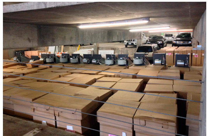
Vertical stacked fan coils line the hotel parking garage where Comfort System's technician teams performed preparation work on the new units.

In addition, Daikin Applied supplied 3 custom Skyline outdoor air handling units for supplemental air handling in the hotel's public spaces that include hallways and elevators. "Like the fan coils, these units also replaced McQuay equipment and are used to feed chilled water in conjunction with energy recovery ventilation (ERV) systems by another manufacturer to reclaim energy from the building's exhaust,"