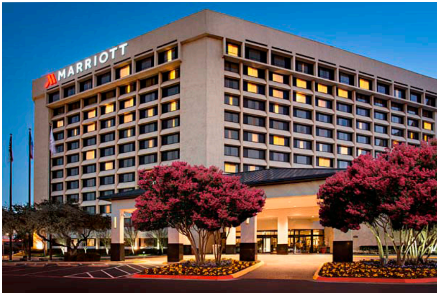
The ENERGY STAR earning Marriott Quorum sits among premier restaurants, entertainment, and shopping in the North Dallas area and receives rave reviews from guests and businesses.