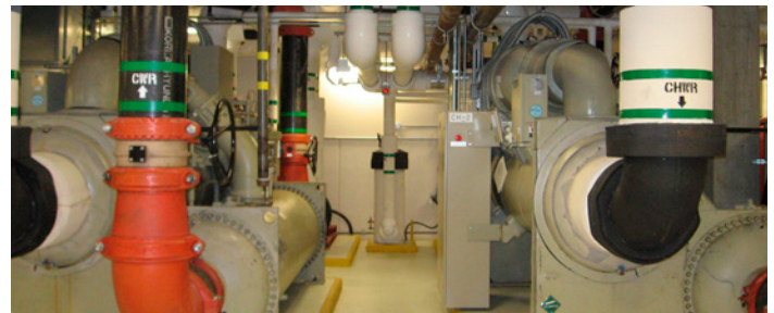
Two 900-ton Daikin Centrifugal Chillers installed in series counter-flow configuration at Abbotsford Hospital.

Annual Energy Operating Cost Savings Approximately $480,000 CAD