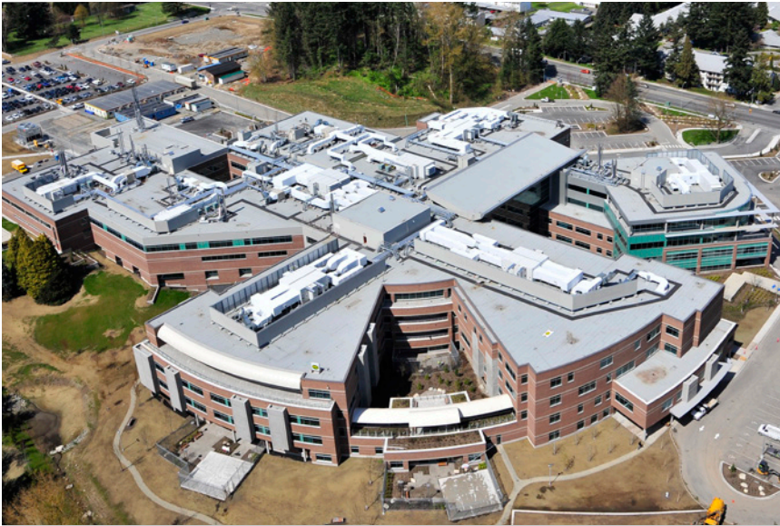
The Abbotsford Regional Hospital and Cancer Centre was the first hospital in Canada to earn LEED®-NC Gold certification.